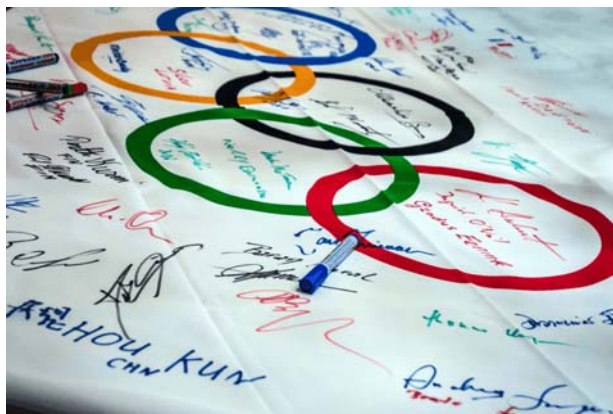
Olympic flag signed by participants.