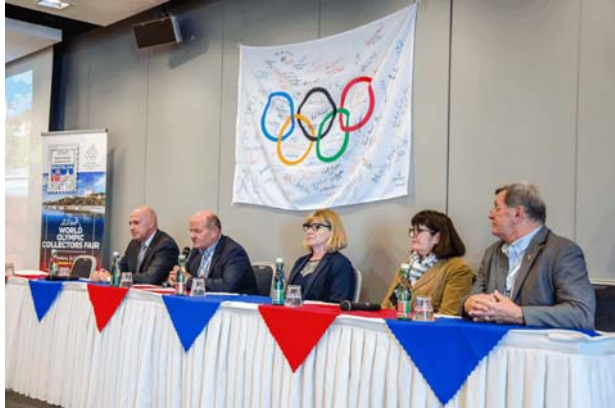
Opening Ceremony on Day 1 of the Fair.