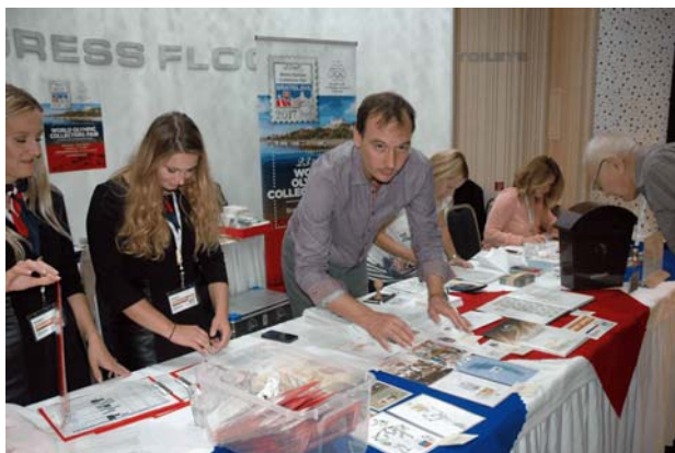
Slovak Post Office representative processing postmarks.

On Friday, 8 September – the first day of the fair which was held at the NH Gate One Hotel in Bratislava – the Slovak post office (Pofis) was at the participants' disposal. One could purchase special postage stamps and postcards bearing the fair logo, and obtain a special unique postmark created especially for the Olympic Fair. At the entrance table, participants and visitors could also buy a special pin, made only for this occasion, with the logo of the Fair.