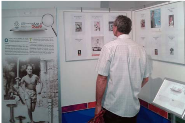
At the "Find your own Hobby" museum exhibit.