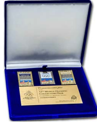
Pin collection presented to ceremony guests.