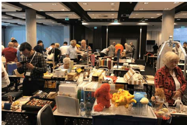
The show floor was busy with Olympic activity.