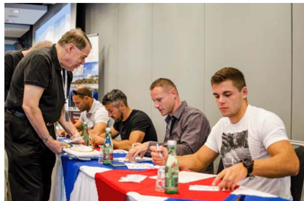
Autograph signing event.