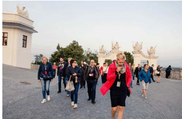
On tour at the Bratislava Castle.

In the late afternoon, following the conclusion of the first day of the fair, participants were invited to visit the Bratislava historical museum in the center of the city for a special exhibition "Find your own Hobby" created by the Slovak Olympic and Memorabilia collectors. A special sightseeing tour by train, organized by the fair committee, took participants to the Bratislava Castle and historical center of the old town of Bratislava.