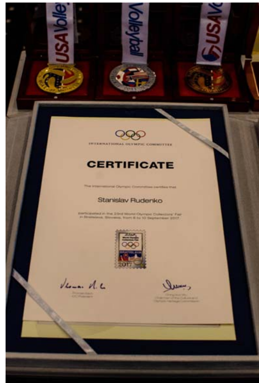
Each Fair participant was presented with a handsome diploma from the IOC.