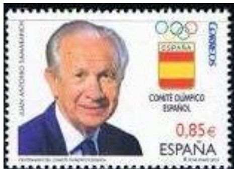
Juan Antonio Samaranch, Barcelona 1951