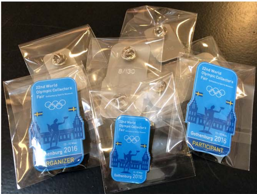
3 different pins - Organizer (20 pcs), Participant (130 pcs), visitor pin (350 pcs).