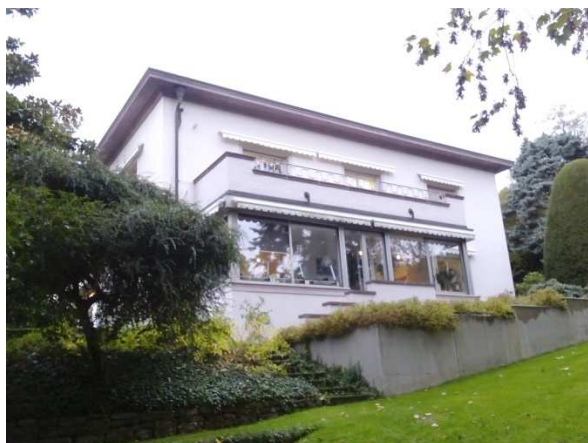
The IOC Olympic Study Centre in the Centenary Villa