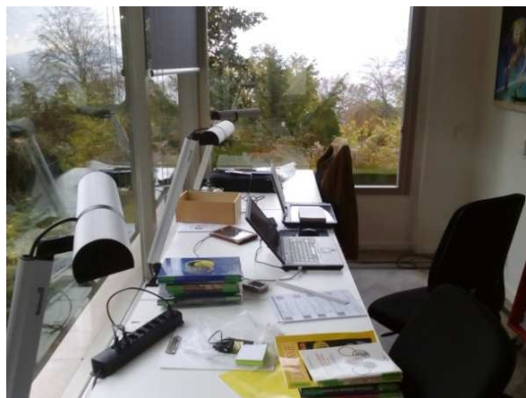
Available work space for scanning publications for AICO

In all, I studied and registered over 60 publications, about 40% of holdings on Olympic collecting, and took more than 300 images.