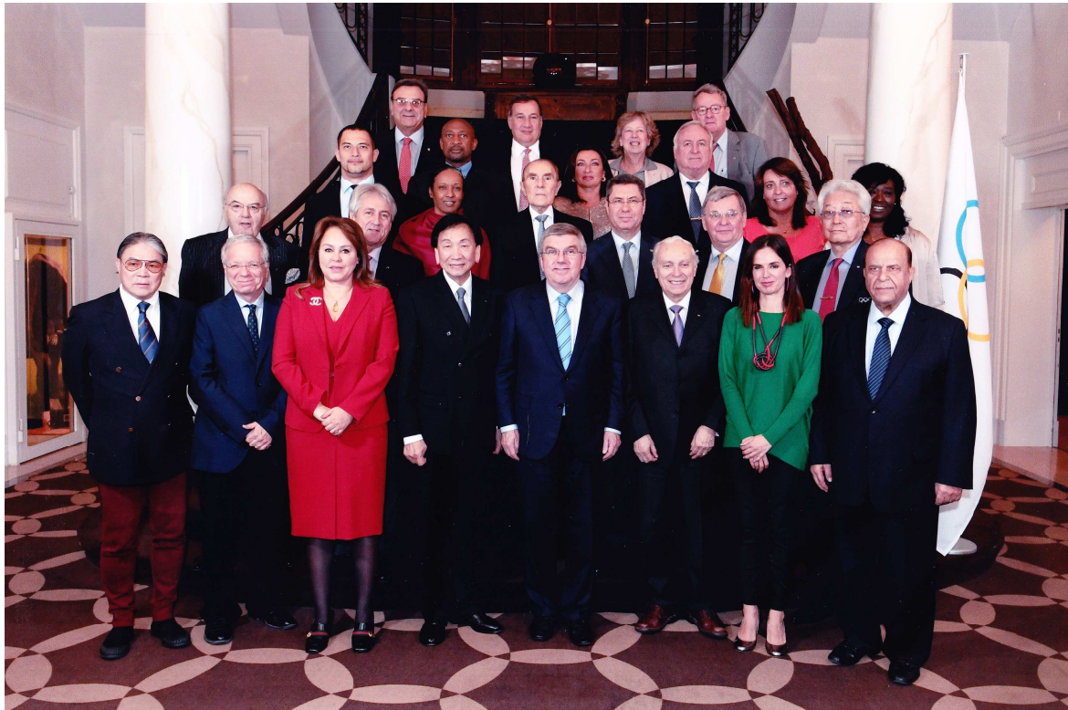
Dr. Thomas Bach, IOC President with members of the Culture and Olympic Heritage Commission present at the meeting, Lausanne, 11 November 2017