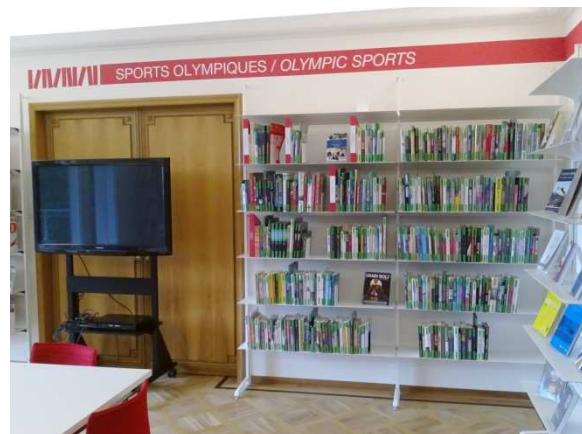
The Olympic World Library OWL