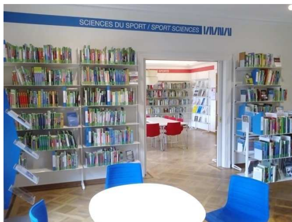
The Olympic World Library, OWL at the OSC